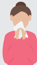
More infections than normal