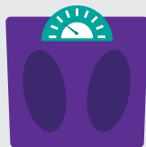
Unexplained weight loss