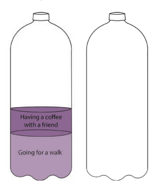
Figure: Use the empty bottle on the right to plan your day as in the example on the left

If you don't have enough energy to do everything you'd like to, think about which tasks or activities are your priorities. You could ask for help with some things, or do them on another day.