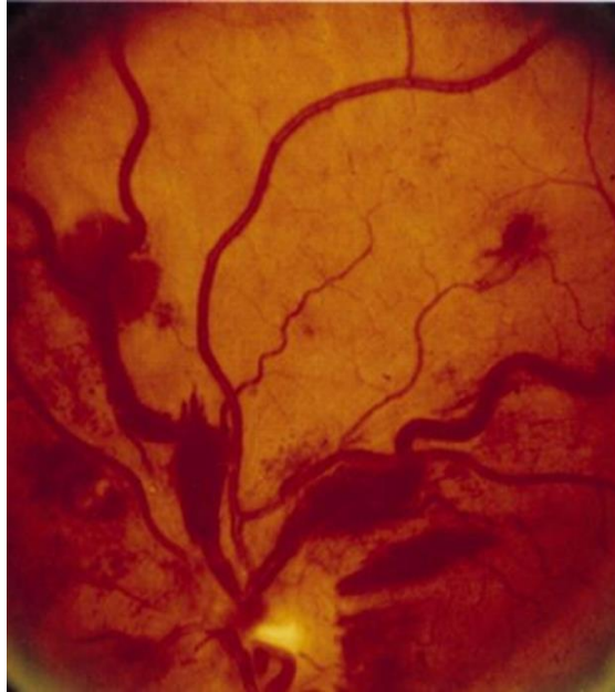
Figure: Blood vessels in an eye with hyperviscosity. The veins are wider and more twisted with some swelling and bleeding.

If you have been diagnosed with WM and your specialist feels you should start treatment, you might also have a CT scan or a PET/CT scan to assess whether your lymph nodes, liver, spleen or other organs are affected by WM. If you have swollen lymph nodes, you might have a lymph node biopsy .