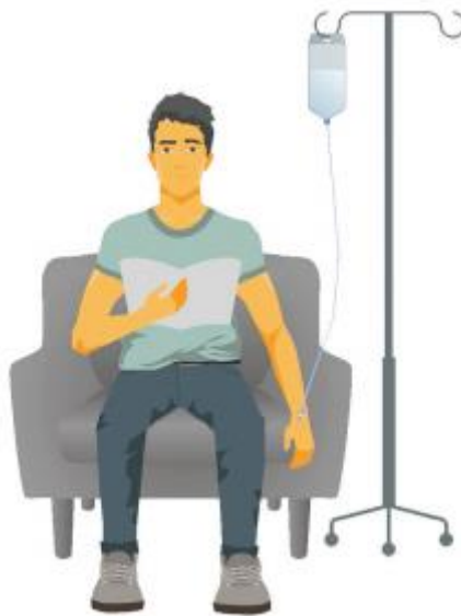
Figure: Having chemotherapy through a drip

Intravenous CNS prophylaxis involves having chemotherapy through a drip into a vein. It can be used for drugs that cross the blood–brain barrier. Most people who need CNS prophylaxis have it this way.