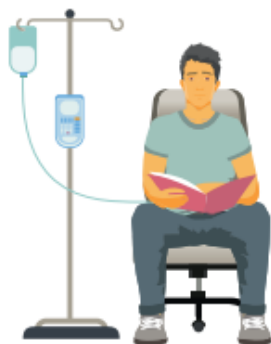
Figure: Having CAR T cells